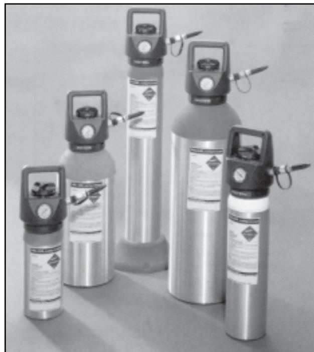
Complete helium systems are also available from Western. Now five popular sizes to choose from.