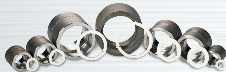
US & Foreign Patents Issued & Pending

SoluGap® Water Soluble Socket Weld Spacer Rings are made of EPA Approved AquaSol® Water Soluble Board. Dissolves completely and rapidly in most liquids. Unique tabs secure placement regardless of orientation. Compatible with any metal.