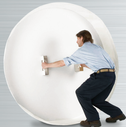
US & Foreign Patents Issued & Pending

EZ Purge® is a pre-formed, self-adhesive, water soluble purge dam that enables welders to save time on weld preparation as well as improve project timeliness. Since EZ Purge® is pre-formed; there is no need to measure, cut or construct a purge dam. Setup and installation time is completed in minutes, making EZ Purge® the most efficient and economical purge dam available.