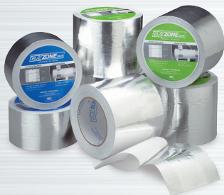
US & Foreign Patents Pending

EZ Zone® Tape is a purge gas retaining tape used to seal the root gap between pipes to trap argon gas. Composed of two adhesive sections separated by an adhesive-free center zone. The adhesive portion of the tape never comes in contact with the pipe as it is welded; creating a clean, contaminant-free weld. Halogen and chlorofluorocarbon free.